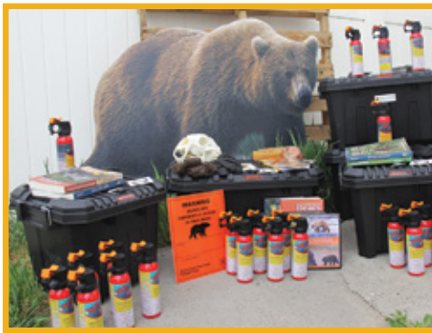
Our bear safety toolkits include inert training canisters, bear safety information, books on living in bear country, bear safety training DVDs, and more.

Our 2021 field season has involved a mix of wolf, bear, and lion projects. As more people flood to Montana for the beautiful landscapes and recreational opportunities, bear safety has become increasingly important. This year we conducted several targeted bear safety trainings to educate