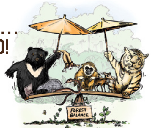
Umbrella species like wolves and bears indirectly protect many other animals.

The term umbrella species describes species that, when protected, indirectly protect other animals. Conservation management decisions are sometimes made using the umbrella concept as a way to efficiently conserve multiple species. The descriptor charismatic species, or charismatic megafauna, is more subjective in that it generally describes wildlife species that are so prominent they