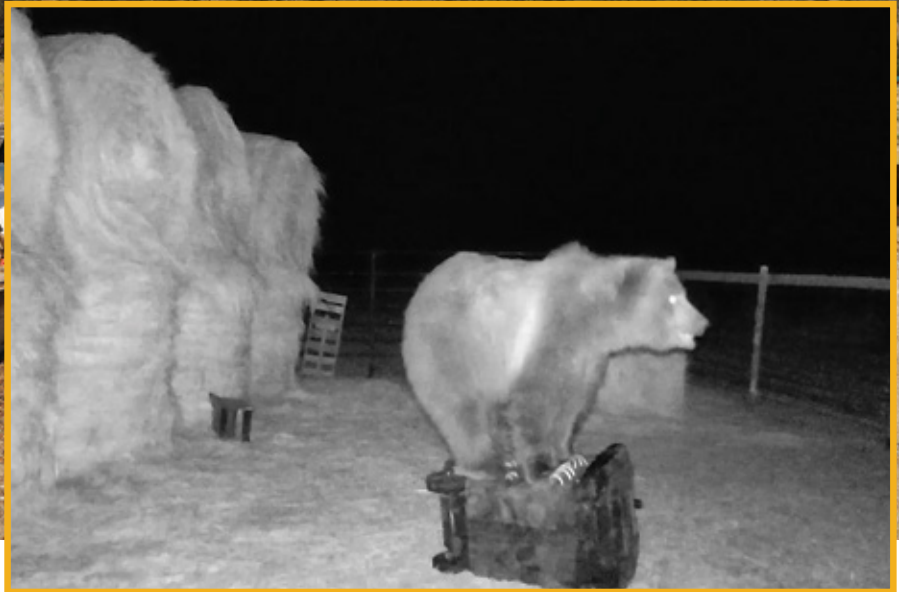
This bear-resistant canister was placed at a ranch to help secure trash and dog food, and a grizzly bear showed up a couple days later. The canister held up.