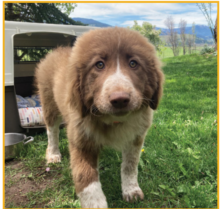
One of the livestock guardian puppies we placed at a small ranch with carnivore conflicts. Others joined it soon after!

Each year, we are asked to consult and advise to practitioners all over North America and even Europe occasionally, particularly on fencing. We decided to invest in development of a comprehensive digital instructional guide or manual to teach people how to build fences to deter bears. We have spent several days in the field filming while installing fences at project sites and writing instructions with technical detail. We hope to get the manual up on our website by the end of the year. There are many more projects in the works, including working through homeowner associations and vacation rental booking agencies to address attractant reduction in rural communities and at vacation homes.