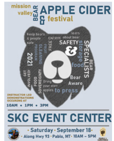
Poster for the Gleaning Festival.

Mission Mountain Bear and Apple Cider Festival at the Salish and Kootenai College's event center. The festival combines education and outreach with good old-fashioned fun, as community members are able to make their own cider with four apple presses as well as learn about bear safety at several booths staffed by experts. In addition to the festival, the Mission Valley Gleaning Program maintains drop-off locations in three towns in the Mission Valley, hauling the collected fruit to processors such as Missoula's Western Cider as well as to food distribution centers in Missoula and Lake counties.