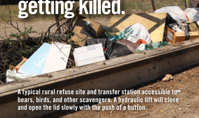
A typical rural refuse site and transfer station accessible to bears, birds, and other scavengers. A hydraulic lift will close and open the lid slowly with the push of a button.