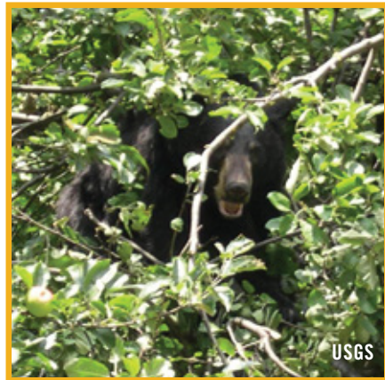
This is what we don't want to see!

When apples ripen in the fall, bears take notice. Drawn by the need to accumulate fat reserves for the coming winter, they seek out fruit wherever they can find it, even when it brings them near homes. This often leads to an annual, predictable string of run-ins between homeowners and wild animals, resulting in the trapping and removal of both grizzly and black bears.