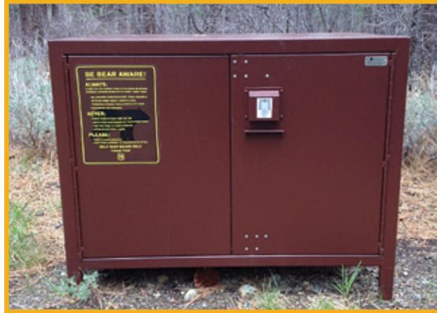
In order for food storage requirements to get enacted, bear-resistant equipment must be in place.

There are small populations of grizzlies in the Idaho panhandle, in the Selkirk and Cabinet-Yaak ecosystems, and we know some bears are venturing south. As bears disperse towards the BE, they may encounter deadly attractants including human foods and garbage at campgrounds and recreation sites, as well as at county refuse sites. To help prevent future conflicts in northern and central Idaho corridors, P&C is working with the Idaho