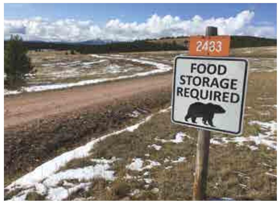
We are working to expand National Forest food storage orders and signage in areas where grizzlies are starting to show up.

People and Carnivores staff was also early fladry users and developed equipment to help practitioners more efficiently deploy the flagged fencing. We have spent years creating innovative solutions to dirty garbage dumps, some of them working and others serving as useful tests. In the last couple years, we innovated bear deterrent fencing around different