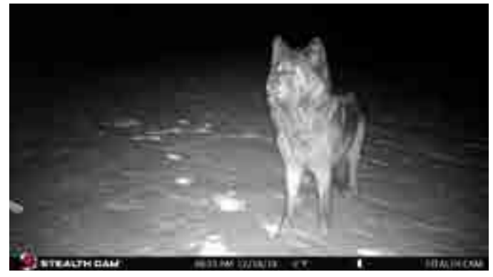
This wolf was caught by one of our trail cameras on a fladry project. Cameras help us monitor fence line activity.

practices. You may remember that Keystone Conservation was a pioneer in the use of range riders to prevent conflicts with wolves outside of Yellowstone a dozen years ago. We learned that riders need to actively bunch livestock, a natural prey defense strategy, and we wrote a groundbreaking paper on how this technique not only protects livestock and carnivores, but also improves land health because dispersed livestock create more negative impacts.