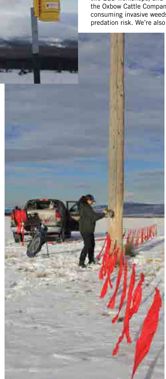
Our Kim Johnston installs fladry fencing at a ranch in the Big Hole Valley to keep wolves away from a calving pasture.

FENCING. Fladry continues to be an effective short-term method to keep wolves away from livestock. We'll install an 80-acre fladry fence in a Big Hole Valley location this winter where many wolves