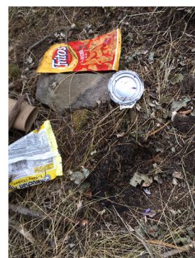
Above: Unsecured garbage waiting for pickup in rural Montana. Left: A bear print near an unsecured garbage site.

Some people have expressed concern about using electric fencing in a public setting. We feel that good design and common sense can minimize this risk. Modern electric fence delivers a pulsed, split-second shock that non-injuriously repels animals. It has a solid track record of safety. Canada's Banff National Park has long used electrified cattle guards at conflict-prone campgrounds to keep bears out, yet allow visitors easy access. With smart design and adequate signage, we can minimize safety risks.