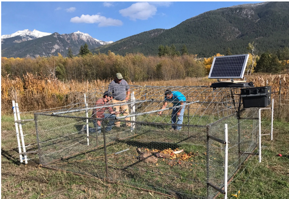
Bryce and two project partners set up a test of our prototype mobile chicken coop.

View interactive version at peopleandcarnivores.org/where-we-work/