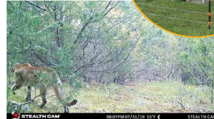
A mountain lion caught on one of our trail cameras

Virginia City is a rural community that sits in the center of a narrow corridor connecting the Gravelly and Tobacco Root mountains. While the Gravelly range to the south is home to grizzlies, wolves, mountain lions, wolverines, and more, the Tobacco Root range has yet to have a confirmed grizzly bear sighting. Yet, it has been identified by research as a key travel point for grizzlies. With sightings just a few miles from this corridor, we are working closely with Virginia City to develop a community-wide prevention program, with a goal of it becoming a “Bear Smart Community” within three years. This summer, the town completed the installation of 14 steel bear-resistant garbage canisters through the town center. We also funded and distributed 20 bear-resistant residential garbage canisters to various businesses and residents throughout the community and are working closely with others to secure attractants. At a nearby RV park we helped the owners monitor the presence of a mountain lion (photo above) that was in the vicinity.