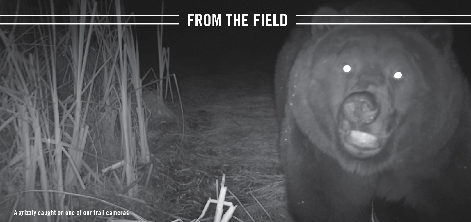
A grizzly caught on one of our trail cameras