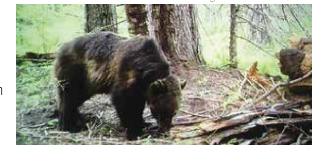
The wandering young grizzly in Idaho.

This is one of the goals we've been working toward together—grizzlies re-establishing themselves in the largest wilderness complex in the West, which is a federal grizzly bear recovery area (the Bitterroot Recovery Zone). The young male travelled all the way from the Cabinet Mountains in northwest Montana. We hope a female is not too far away!