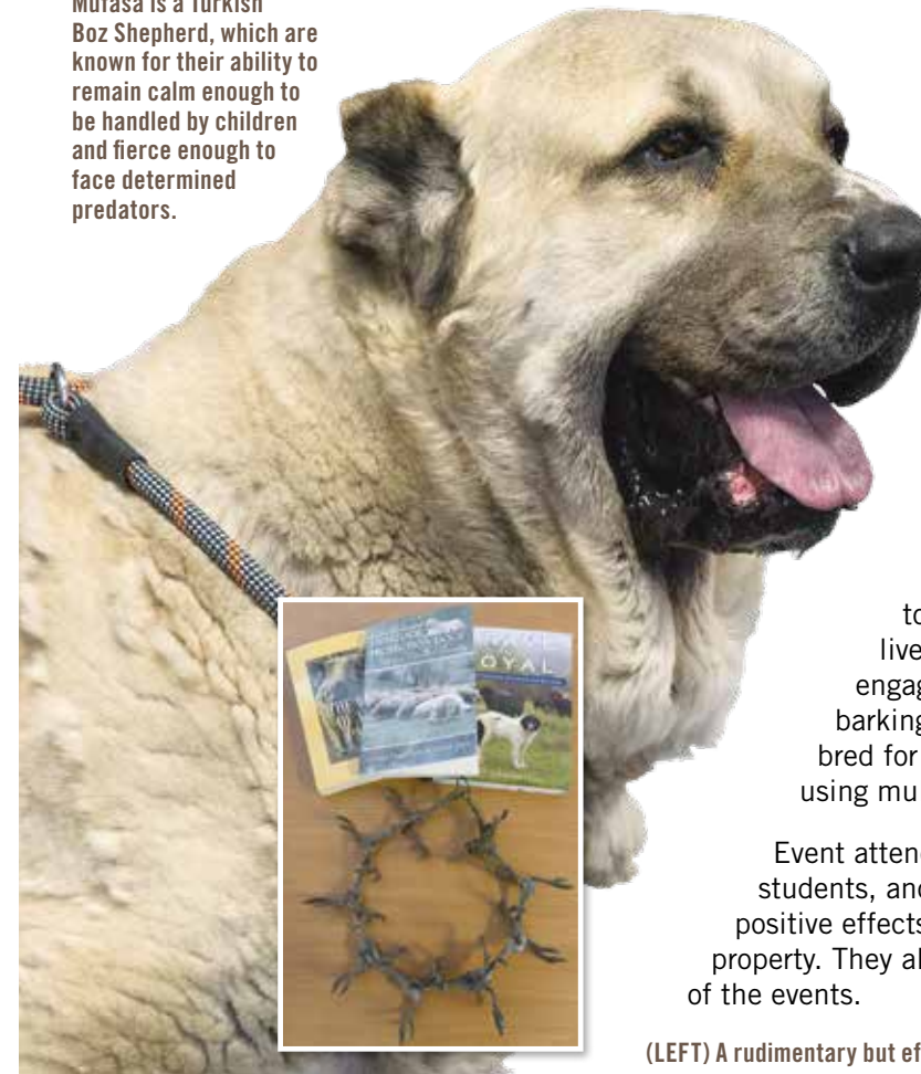
(LEFT) A rudimentary but effective protective collar for an LGD.

Mufasa is a Turkish Boz Shepherd, which are known for their ability to remain calm enough to be handled by children and fierce enough to face determined predators.