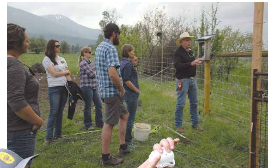
Workshop attendees talk at one of the fencing stations.

The full-day event began with presentations on grizzly bear movement, electric fence technology and maintenance, and some of P&C's recent