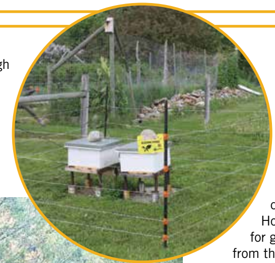
Fencing P&C installed around beehives. We’re working with this landowner on additional tools for livestock as well.

The Big Hole Valley to the west is at the heart of a network of corridors connecting wildlife from all directions. The Big Hole is a linkage point for grizzlies expanding out from the GYE into the Idaho Wilderness and expanding south from the NCDE population, and it continues to support a wide range of other carnivores, including wolverines. We are working on several projects in this area with local agencies, livestock producers and residents. One such project is a partnership with the US Forest Service and the Yellowstone to Yukon Conservation Initiative (Y2Y) to improve food storage on public