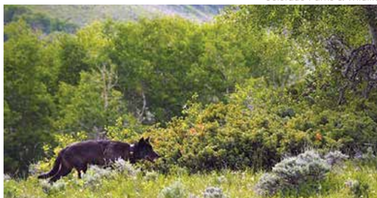
Wolf seen in northern Colorado in July, 2019.

And there's more good news. In mid-July, the Colorado Department of Parks & Wildlife confirmed the presence of a wolf in northern Colorado, west of Fort Collins. The wolf was part of Wyoming's