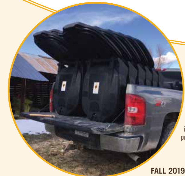
A truckload of bear-resistant canisters ready for delivery in one of our loaner programs.

PROTECTING THE CROWN, continued on page 6