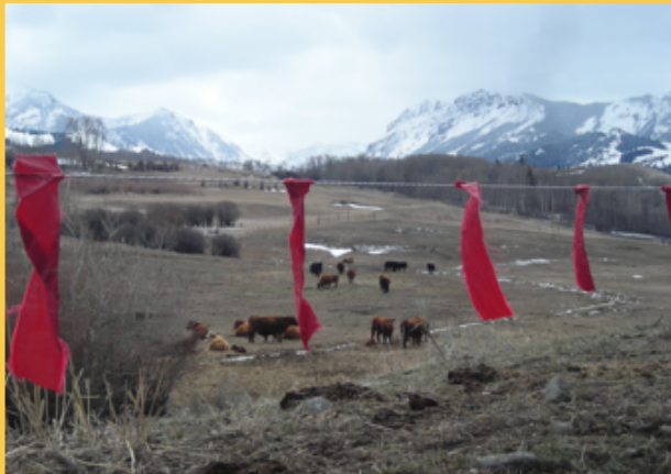
Fladry fencing as a wolf deterrent