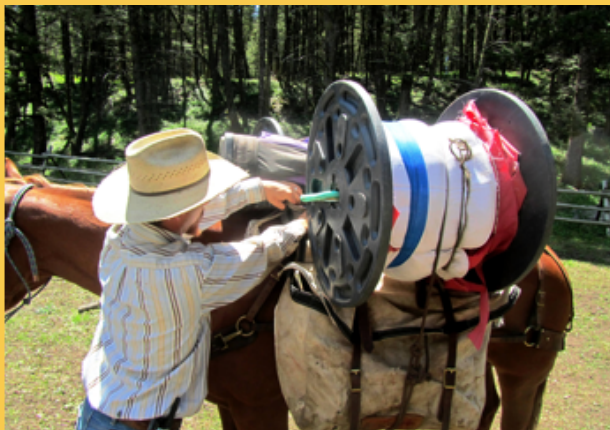
One of our ranching partners preparing fladry