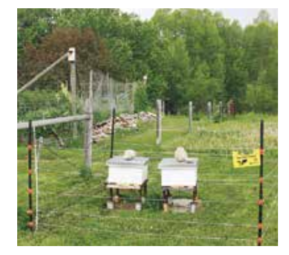
Electric fencing can be simple and effective for smaller areas, as seen around these bee boxes.