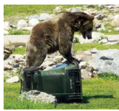
A grizzly bear tests a trash can.

To keep bears out of garbage and recycling, store it in a bear-resistant container or in a secure building at all times—doing both is ideal—until the day of disposal.