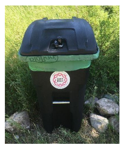
This certified bear-resistant Toter garbage can is being used to store compost that hasn't yet broken down

Beyond securing your compost, decrease the smell with these tips: