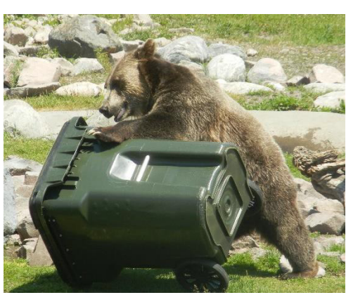
A grizzly bear tests a trash can for strength