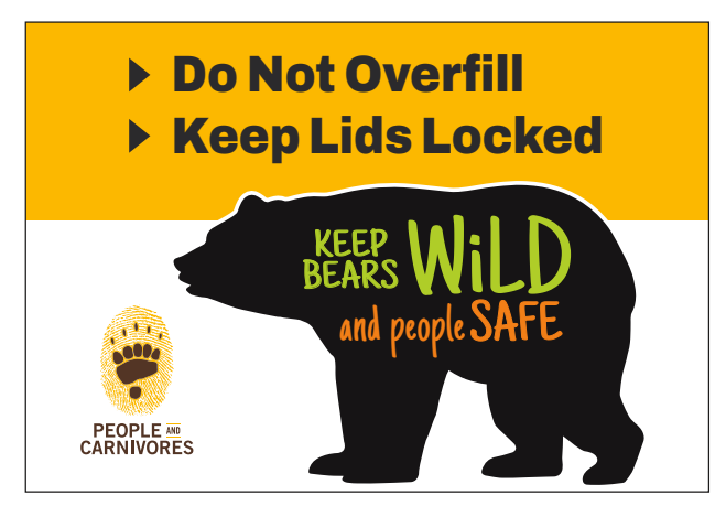
All restaurant trash bins, containers, and dumpsters must be securely closed and, if possible, locked.