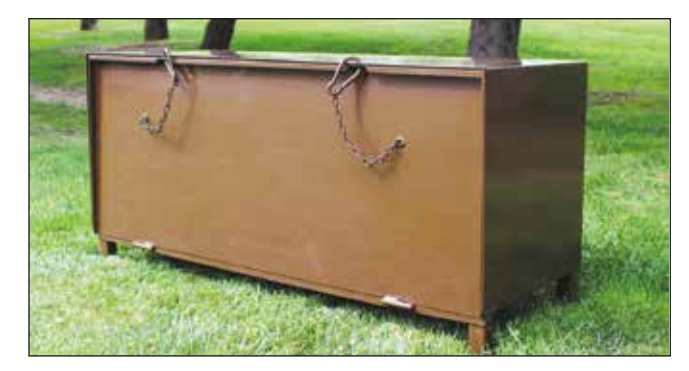
Interagency Grizzly Bear Committee has certified grease containers and other types of bear-resistant storage boxes that can be used to hold grease containers.